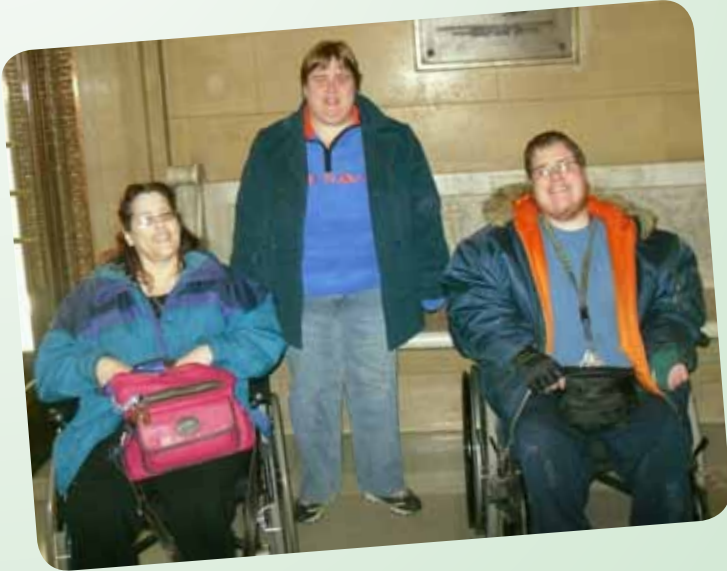
ARRM's Day at the Capital